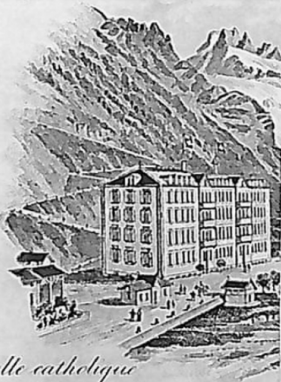
Chapelle catholique & Chapelle anglaise